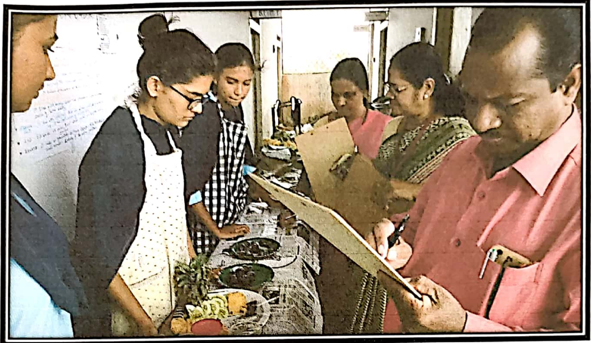
Bidar: 28th July 2018 Cook without Fire & Earn Competition