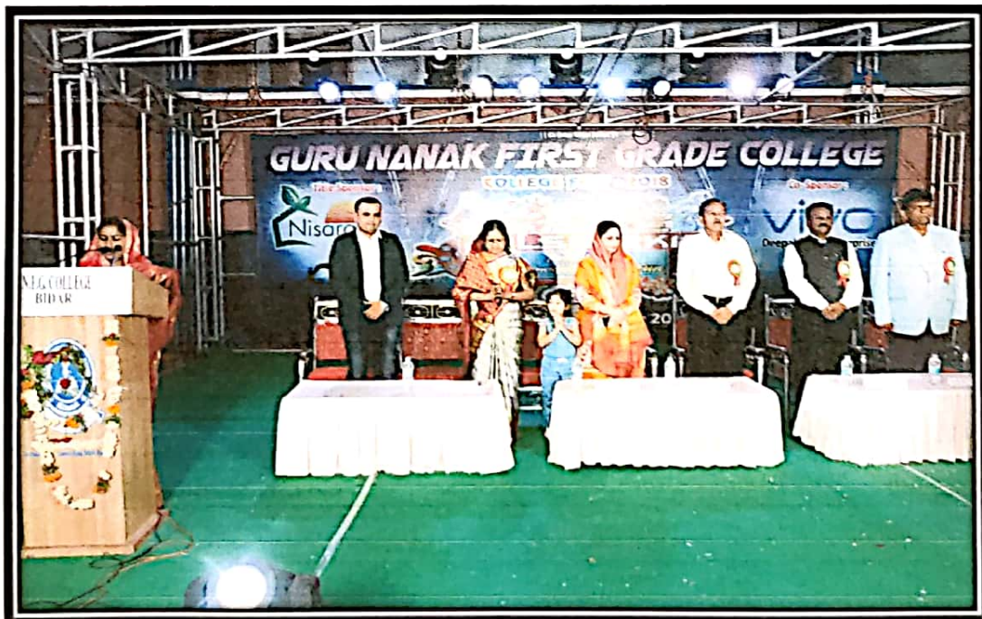
Bidar: 14th October 2018, Jalsa- Closing Function