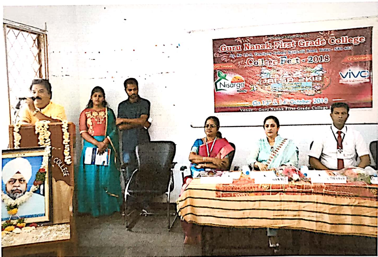
Bidar : 13th October 2018, Jalsa- Inaugural Function