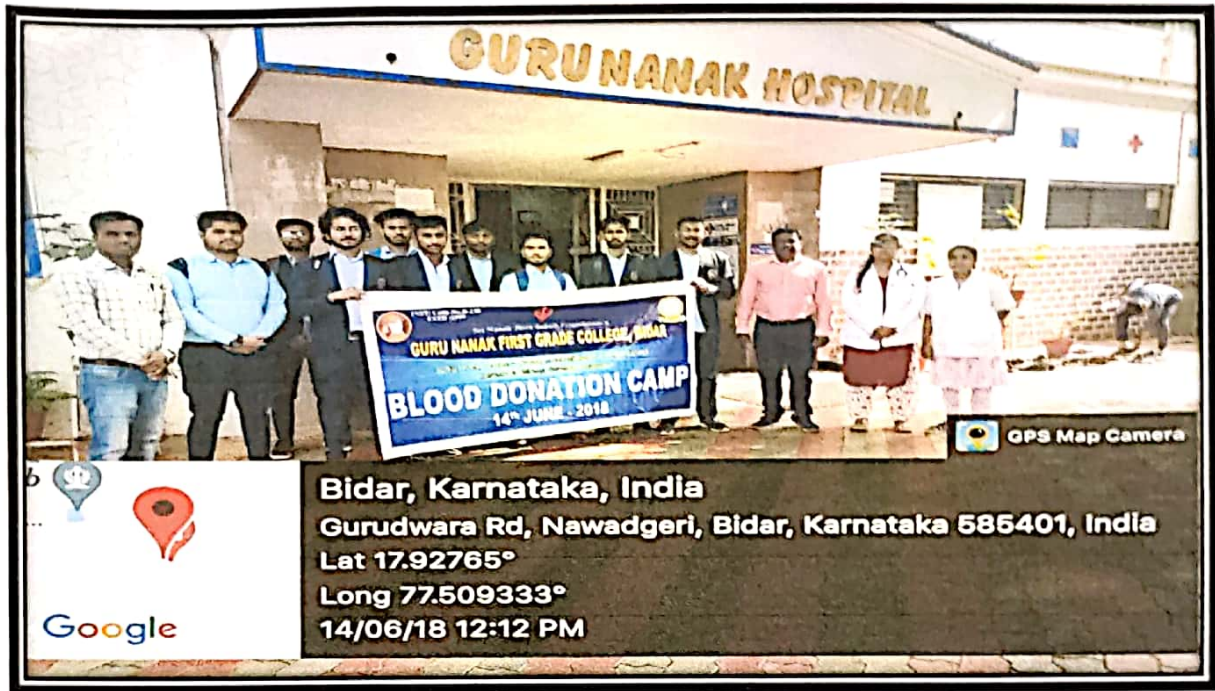
Guru Nanak Hospital, Bidar: 14th June, 2018 Blood Donation Camp